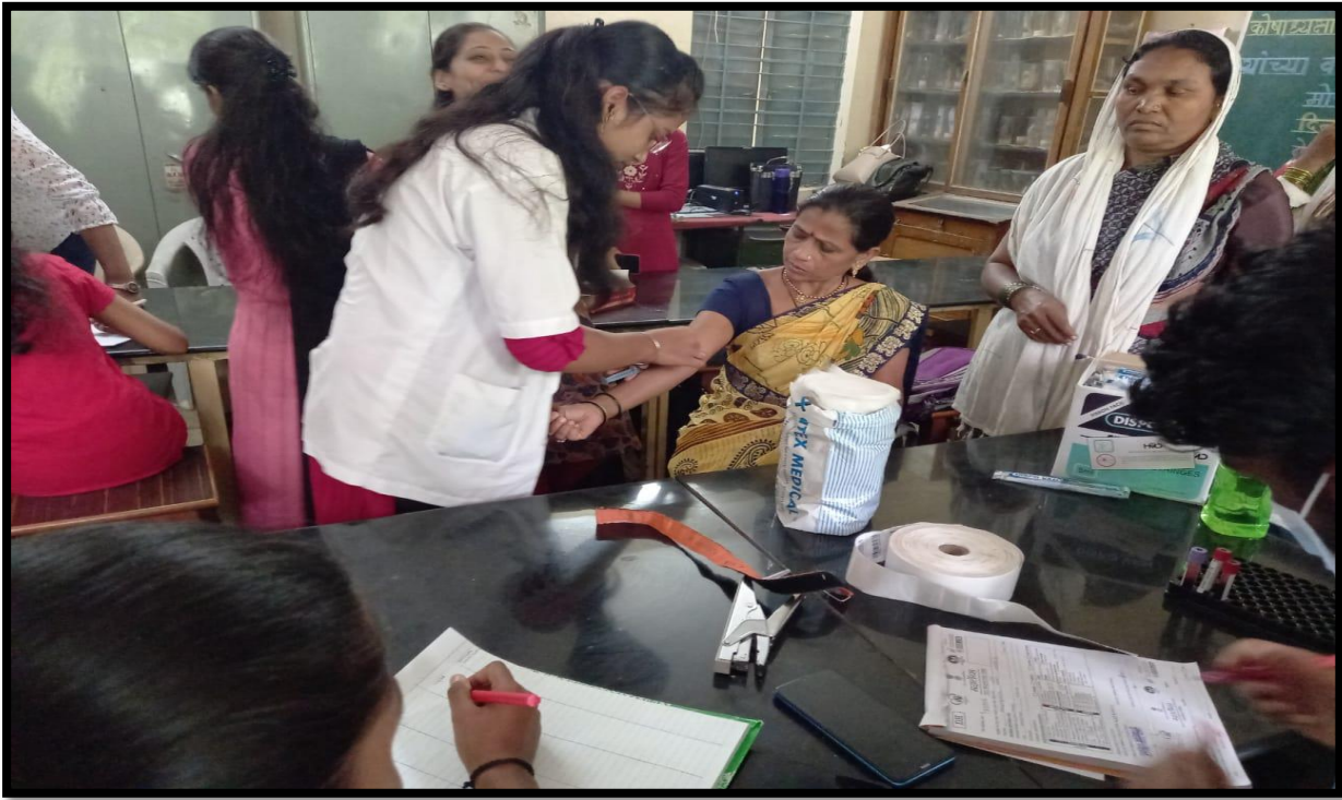
Citizens attending Free Haemoglobin Check up Camp