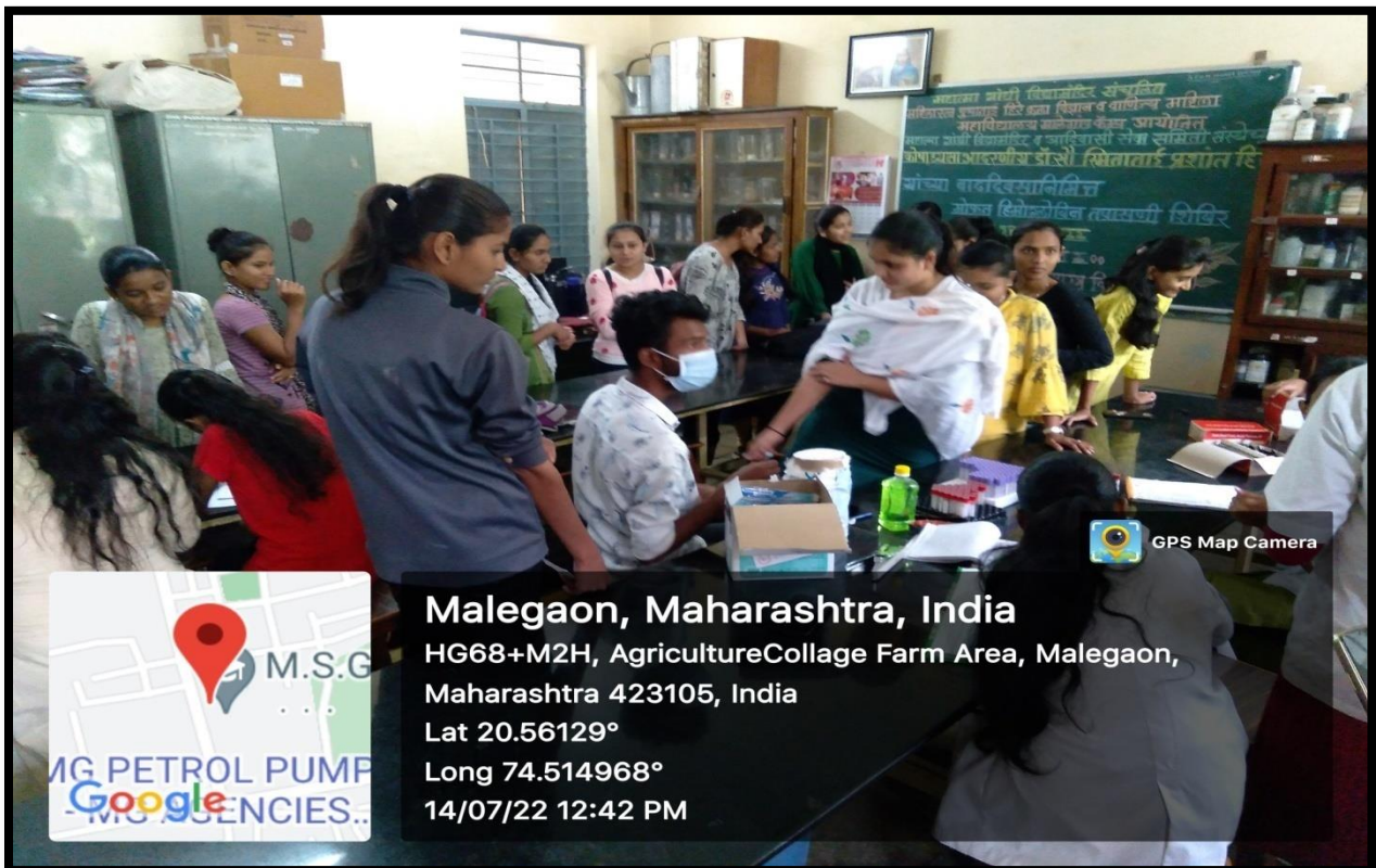
Students are participated in health check up camp

Malegaon, Maharashtra, India Loknete Vyankatrao Hiray Marg, HG67+CQC, AgricultureCollage Farm Area, Malegaon, Maharashtra 423105, India Lat 20.561° Long 74.514378° 14/07/22 12:46 PM