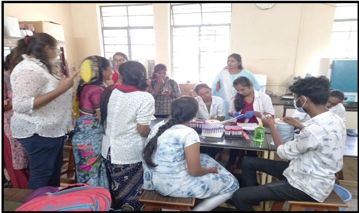
Students attending Free Haemoglobin Check up Camp